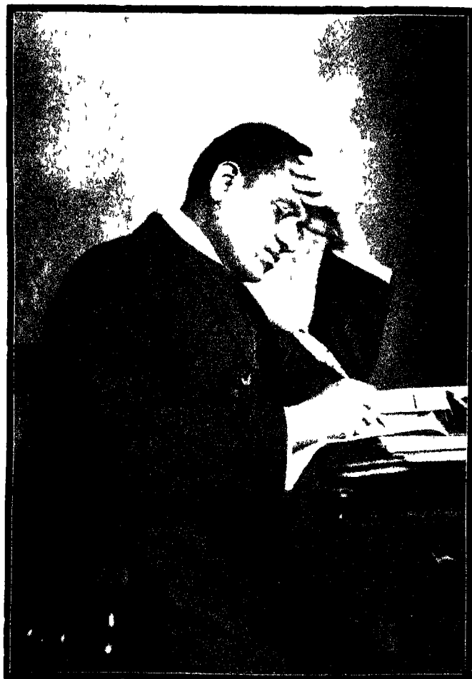
AJIT PRASADA (IN 1909)